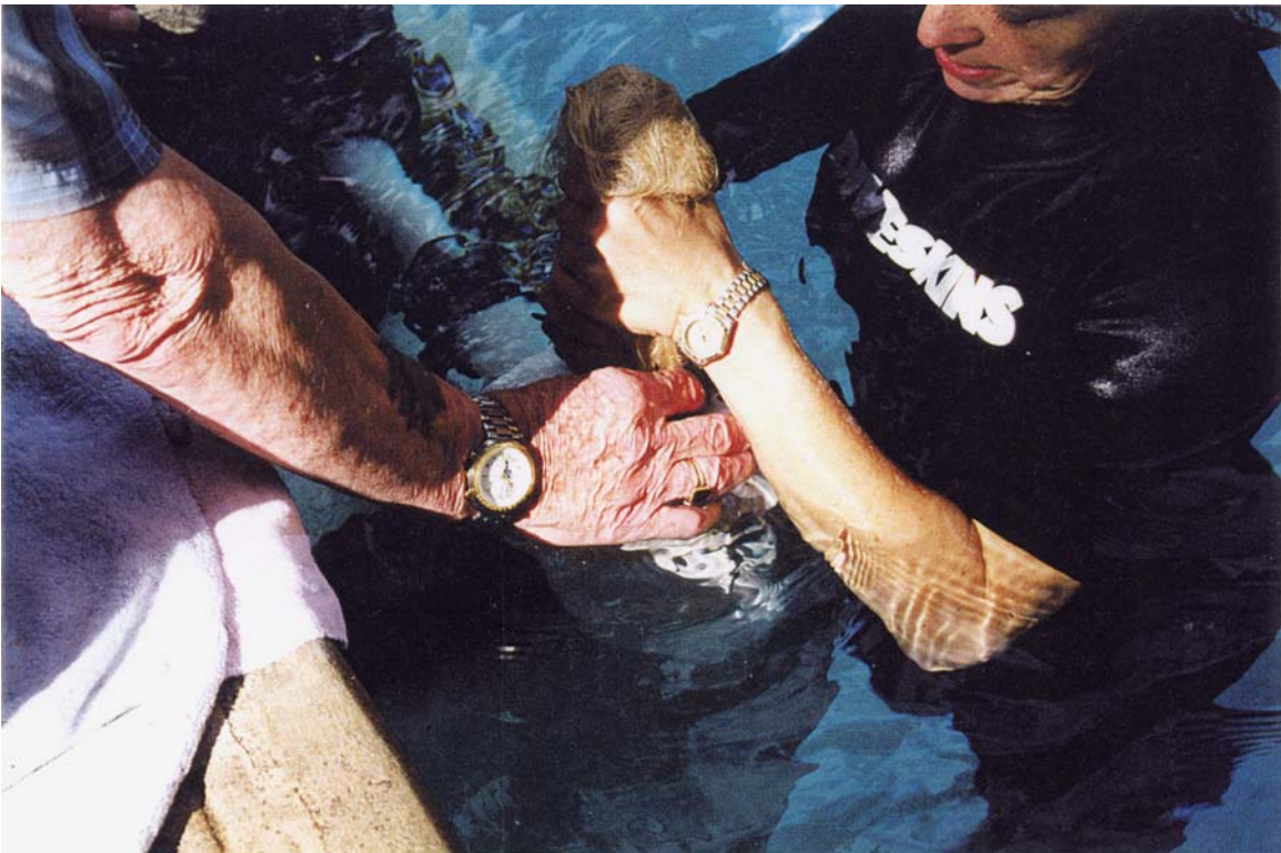
Figure 5 – Failed attempt to manually extract the natural hair wig after the scale pull was stopped to prevent breaking the hair. This is not necessarily the suction cover in any other figure(s).