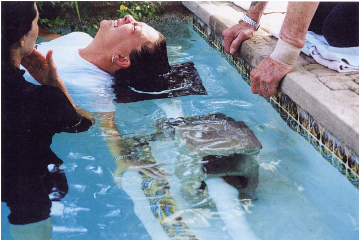
Figure 2 – Test with human subject with 14-inch long brown hair. The subject in this test was pulling uncomfortably against a suction fitting and cover that was exerting significant suction on her hair. This is not necessarily the suction cover in any other figure(s).