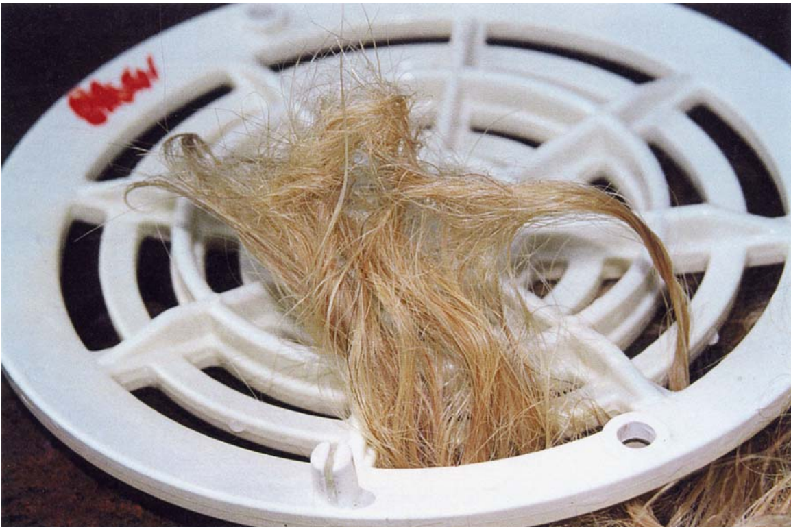
Figure 7 - Underside of a suction cover after attempts to dislodge the tangled natural hair wig by pulling up with the scale and by hand failed. This is not necessarily the suction cover in any other figure(s).