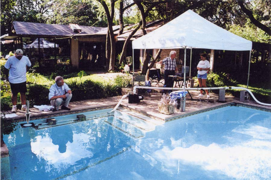
Figure 1 – Test set-up in a residential pool. At left (arrow) is a suction fitting installed horizontally 6 inches below the surface of the pool. The 2" suction line runs to a pump and an ultrasonic, digital flow meter (under the awning). A black plate was installed around each fitting to simulate a pool floor.