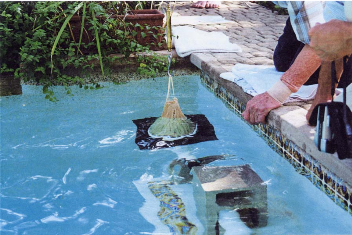
Figure 4 – Test with natural hair, 17-inch-long wig. This is not necessarily the suction cover in any other figure(s).