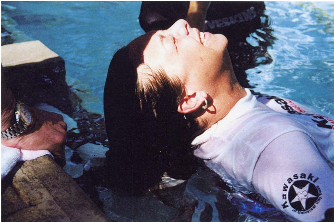
Figure 3 – Another test with human subject with 14-inch long brown hair. The subject in this test was pulling uncomfortably against a suction fitting and cover that was exerting significant suction on her hair. This is not necessarily the suction cover in any other figure(s).